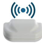
"Smartbox" Sold separately